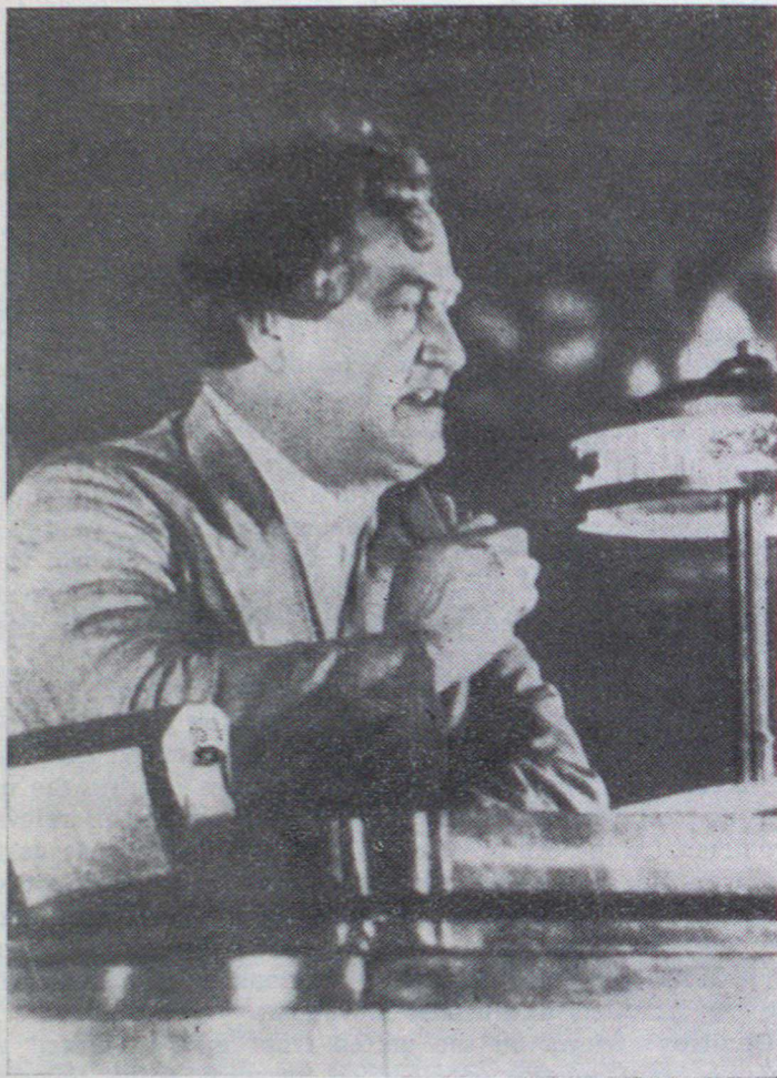
Dimitroff delivering report to 7th Congress of Communist International, Moscow, August 2, 1935

right approach to allies and seek unity of action with them in forming united popular and national fronts.