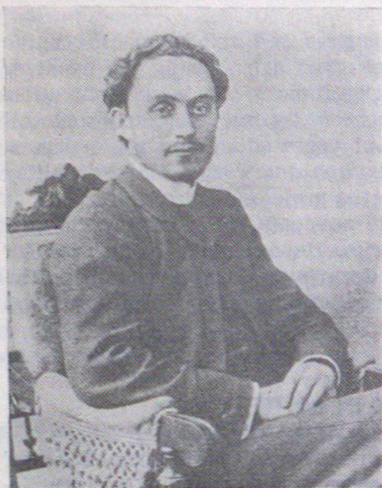
1904—1905. Georgi Dimitrov — Secretary of the Sofia Party organisation

Discontent over the senseless war, the corruption and hunger, mounted. The Agrarian League, with many peasants on its rolls, entered the struggle. The Party, however, underrated the League's political weight. And when the soldiers turned their bayonets against the culprits of the national disaster in the autumn of 1918, the Party again looked on passively, failing even to rally support for the rebels. Dimitrov, who was then in prison, was dismayed: he insisted on closer contacts with the Agrarian League and on aiding the soldiers' insurrection. Regrettably, his advice was ignored.