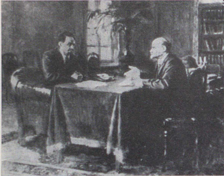
V. I. Lenin and Georgi Dimitrov, Moscow, 1921