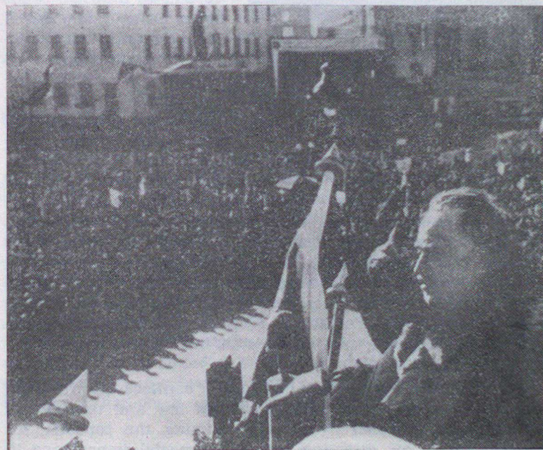
Dimitrov speaking at mass meeting following conclusion of treaty between People's Republic of Bulgaria and Soviet Union, Sofia, March 24, 1948

But Dimitrov warned that the bourgeoisie, still in control of the country's economy, would try to regain its lost positions. He advised the Fatherland Front, made up of divergent