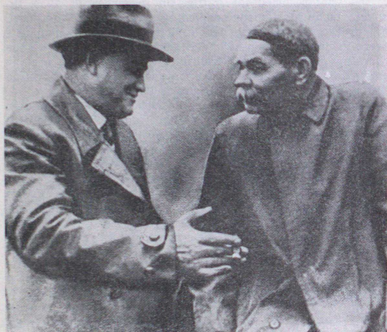
Georgi Dimitrov and Maxim Gorky, 1934

The Soviet press carried articles, reports, letters, photographs about the hero of the Leipzig trial. Dimitrov received thousands of telegrams and letters. He visited many factories and collective farms. His speeches and articles were not only