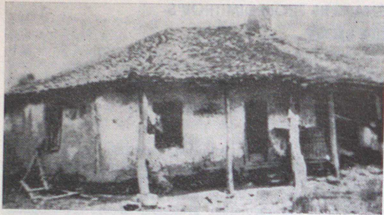
Here Dimitrov was born.

The Dimitrovs had many children. One of Georgi's brothers, a capable trade union functionary, lost his life in the 1912 Balkan War. Another brother was in a Bolshevik organisation in Odessa and died in banishment in 1916. The third brother was killed by the Bulgarian police during the unrest of April 1925. Dimitrov's two sisters, too, participated in the revolutionary movement.