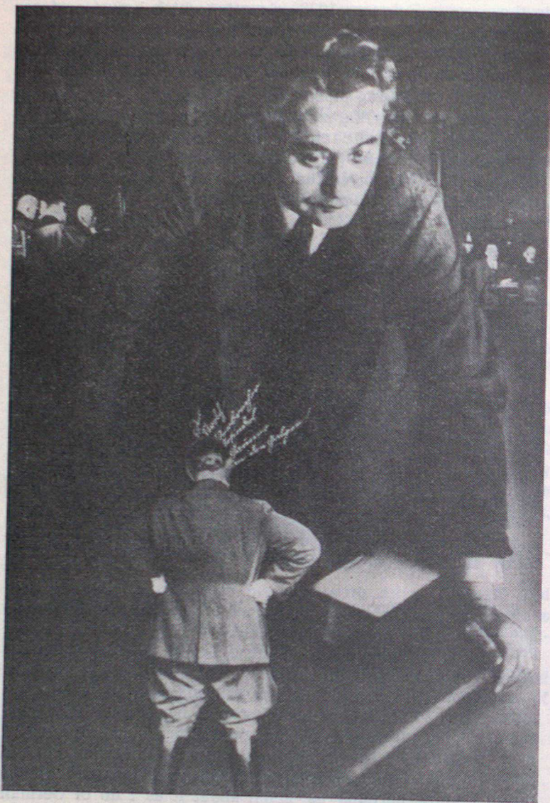
Georgi Dimitrov Accuses

John Hartfield's montage circulated at the time of Leipzig trial, 1933