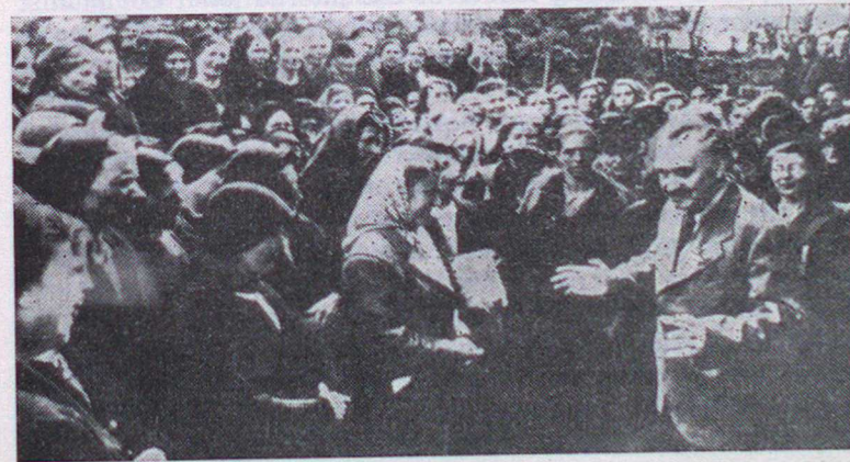
Dimitrov addresses bereaved partisan families, Sofia, May 6, 1947

Educated by Dimitrov in a spirit of loyalty to Marxism-Leninism and proletarian internationalism, in a spirit of revolutionary irreconcilability and perseverance in achieving its goals, the Bulgarian Communist Party continued the